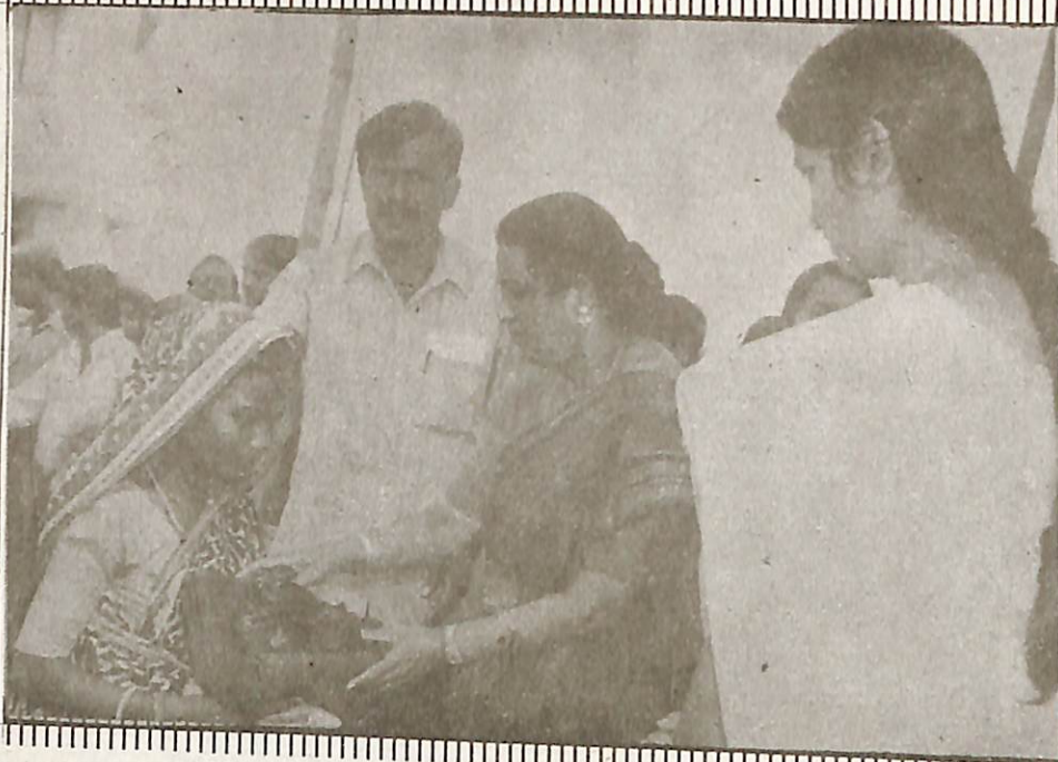
Lady Governor Smt. Susheela Rajendran distributing blankets and food materials to the villagers at Kenduli under Baliana Block on 20.11.99. The relief camp was organised by Khurda District Administration.