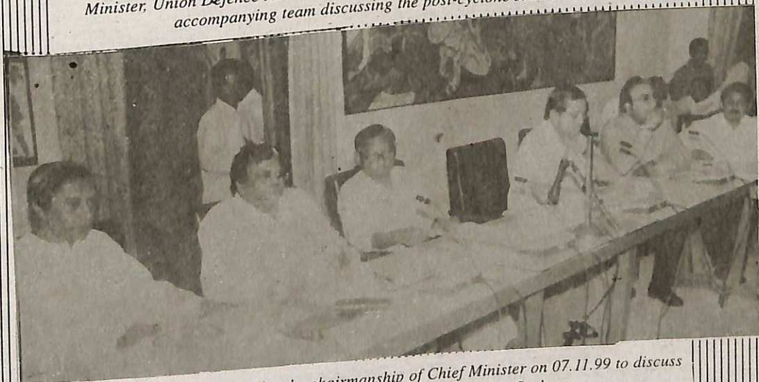
All-party meeting held under the chairmanship of Chief Minister on 07.11.99 to discuss relief assistance on the aftermath of the Super Cyclone.