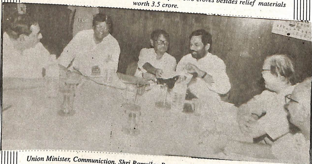
Union Minister, Communication, Shri Ramvilas Paswan discussing immediate resumption of Telephone communication in the affected areas with Chief Minister on 07.11.99.