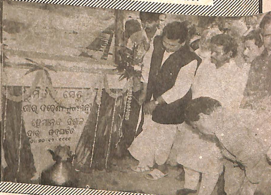
Chief Minister Shri Hemanand Biswal inaugurating the Dhumakata bridge on the Bagadihi—Barapan Road of Jharsuguda District on 20.12.99.