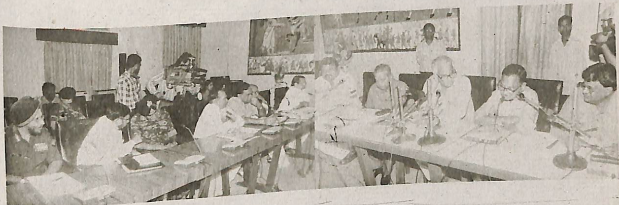
In a review meeting in the 3rd floor Conference Hall of the Secretariat chaired by Chief Minister, Union Defence Minister cum Chairman, Orissa Relief Task Force and his accompanying team discussing the post-cyclone situation.