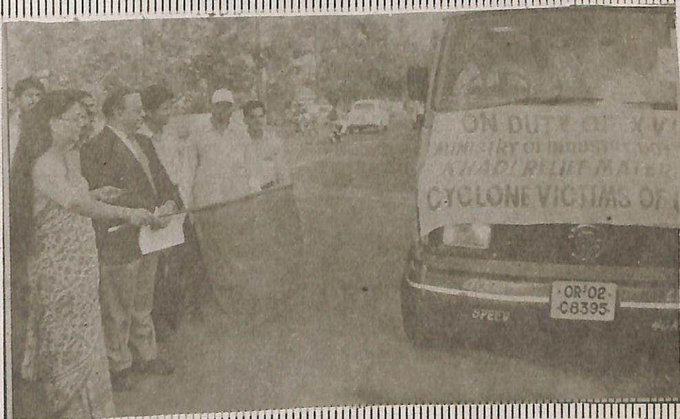
Union Minister of State for Small Industries and Agro & Rural Industries Smt. Vasundhara Raje flagged off K.V.I.C. Relief Trucks in front of I & P. R., Department, Bhubaneswar on 26.11.99.