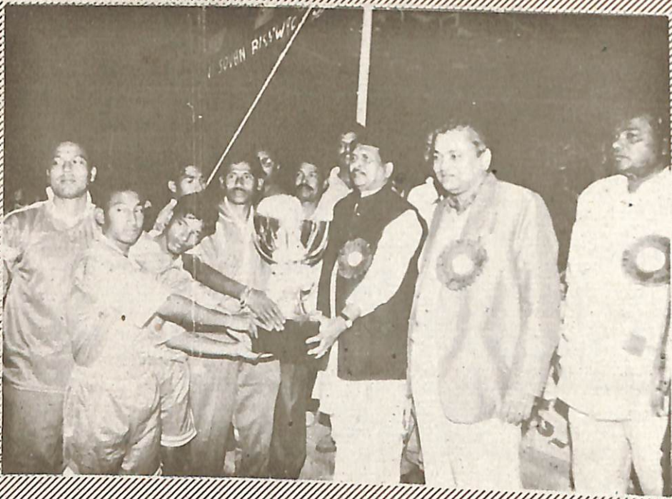
Chief Minister Shri Hemanand Biswal presenting the Soran Memorial Trophy to the winner team of the Football Tournament at Kankamal in Jharsuguda district on 19.12.99.