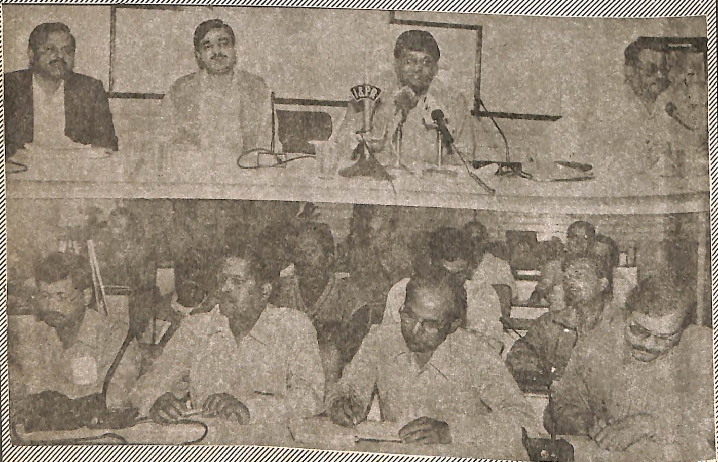
Minister, Revenue Shri Jagannath Patnaik addressing the Press Conference regarding relief operation at I & P.R. Conference Hall. on 12.12.99