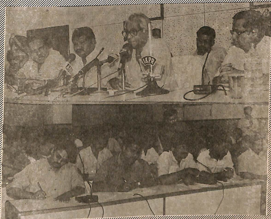
Union Minister for Defence Shri George Fernandes speaking at a Press Conference at the I. & P.R. Department Conference Hall on 12.11.99.