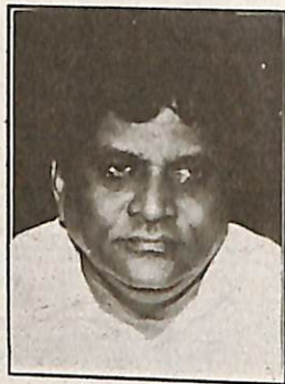
Shri Jagannath Patnaik