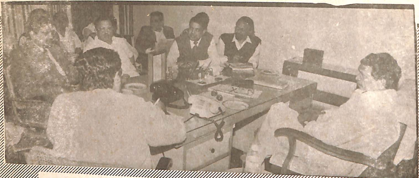
Chief Minister Shri Hemanand Biswal presiding over a high-level meeting regarding the reconstruction work in the cyclone-hit areas on 15.12.99.