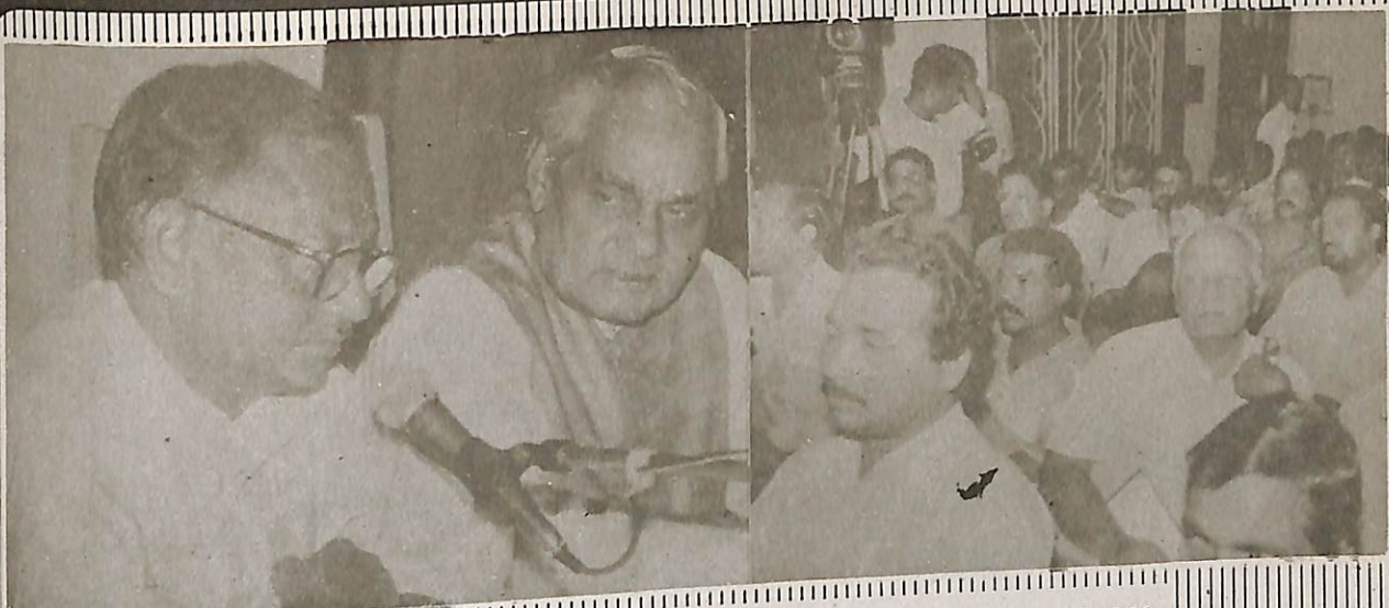
Prime Minister Shri A. B. Vajpayee meeting the Press at Raj Bhavan on 05.11.99.