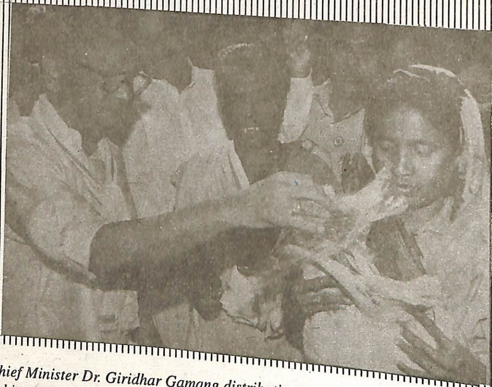
Chief Minister Dr. Giridhar Gamang distributing sarees and dresses to the cyclone hit people on the occasion of the birth anniversary of Late Smt. Indira Gandhi at Congress Bhavan on 19.11.99.