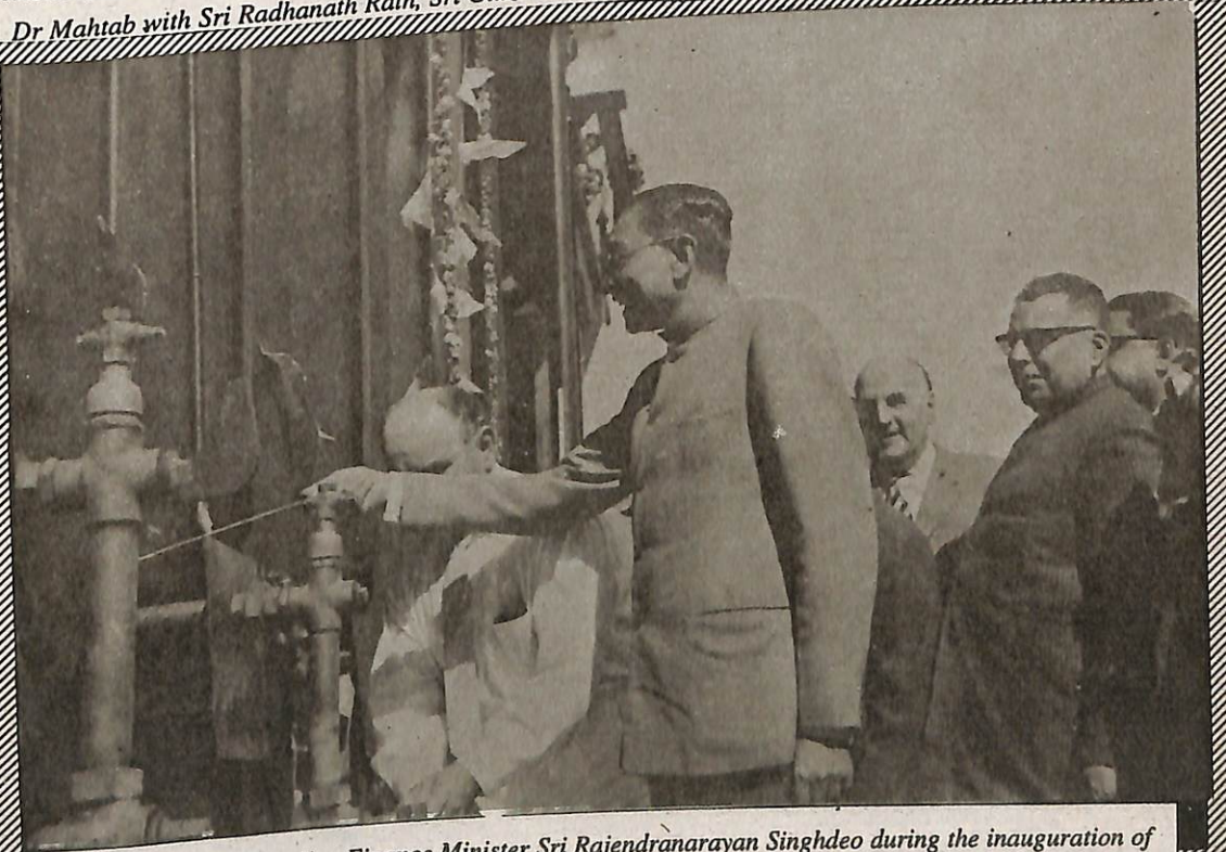
Dr Mahtab with the then Finance Minister Sri Rajendranarayan Singhdeo during the inauguration of one unit of Rourkela Steel Plant.